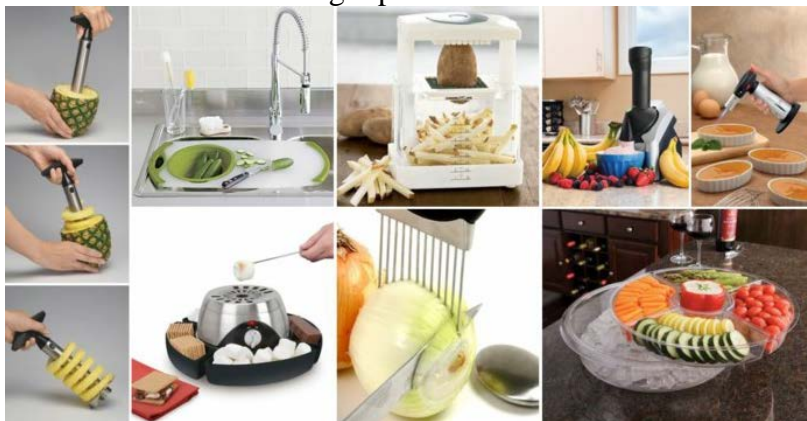
Fig.3 The Finalized Design Pattern Demonstration

With the rapid development of modern science and technology, the modernization of design in our country shows a colorful face. The multimedia technology can assist the design of modern design culture and mobilize the enthusiasm of students to improve the quality of modern design. In this way, the means of modern design can be enriched, and the aesthetic level of modern designers can be improved, which is in favor of the inheritance and development of Chinese traditional patterns. At the same time, designers in the design of all kinds of modern, borrow some traditional patterns with Chinese characteristics to express the design of a certain emotion or thought, making the modern design work both modern and historical sense, making the modern design with a profound traditional Chinese culture to a larger platform.