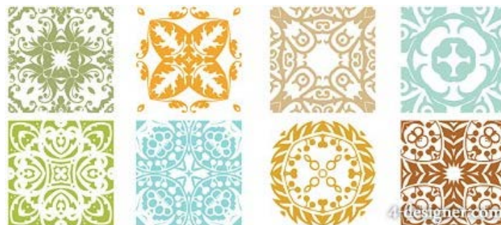
Fig.2 The Advanced Pattern Demonstration

Chinese traditional graphic refers to the decorative patterns of traditional Chinese ceramics such as bronze, jade, lacquer ware, printing and dyeing, embroidery, stone carving, brick carving, wood carving, gold, silver and mural painting. These figures are all ancient skilled craftsmen in the actual life of the extracted, with rich content and unique artistic value, is a symbol of Chinese culture and pride.